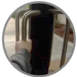
Door Handles and Push Plates