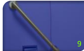
Bathroom Hand Rail