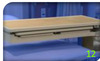
Over Bed Table