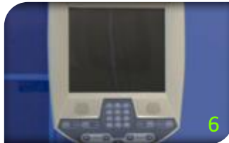
Touch Screen Terminal