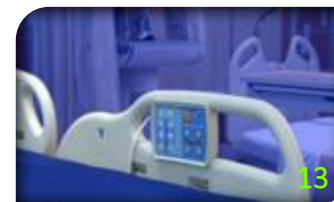
Bed Side Rail