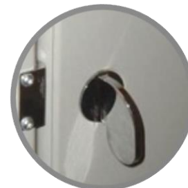
Bathroom Partition Handles