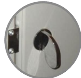
Bathroom Partition Handles, Faucets and Dispensers