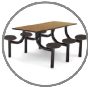
Cafeteria Tables and trays