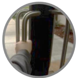
Door Handles and Push Plates