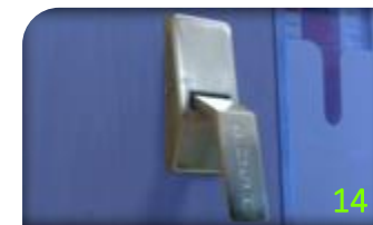
Door Knob / Handle